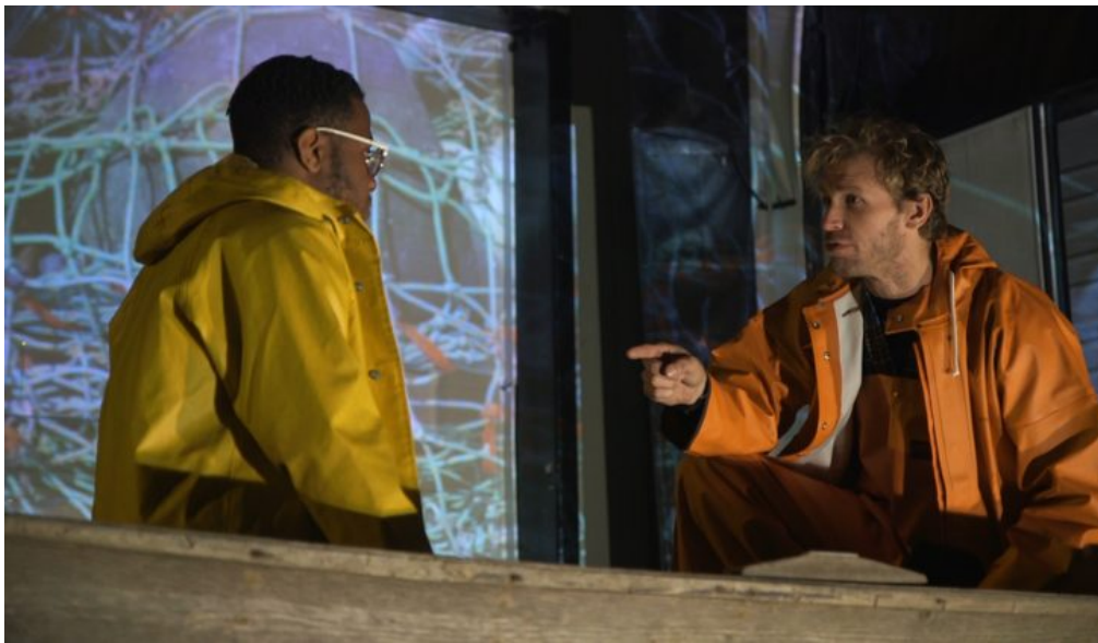
In "Chasing the New White Whale," the plight of a modern-day commercial fishing captain and Ahab's pursuit of Moby Dick, moves between present day and ancient whaling eras.